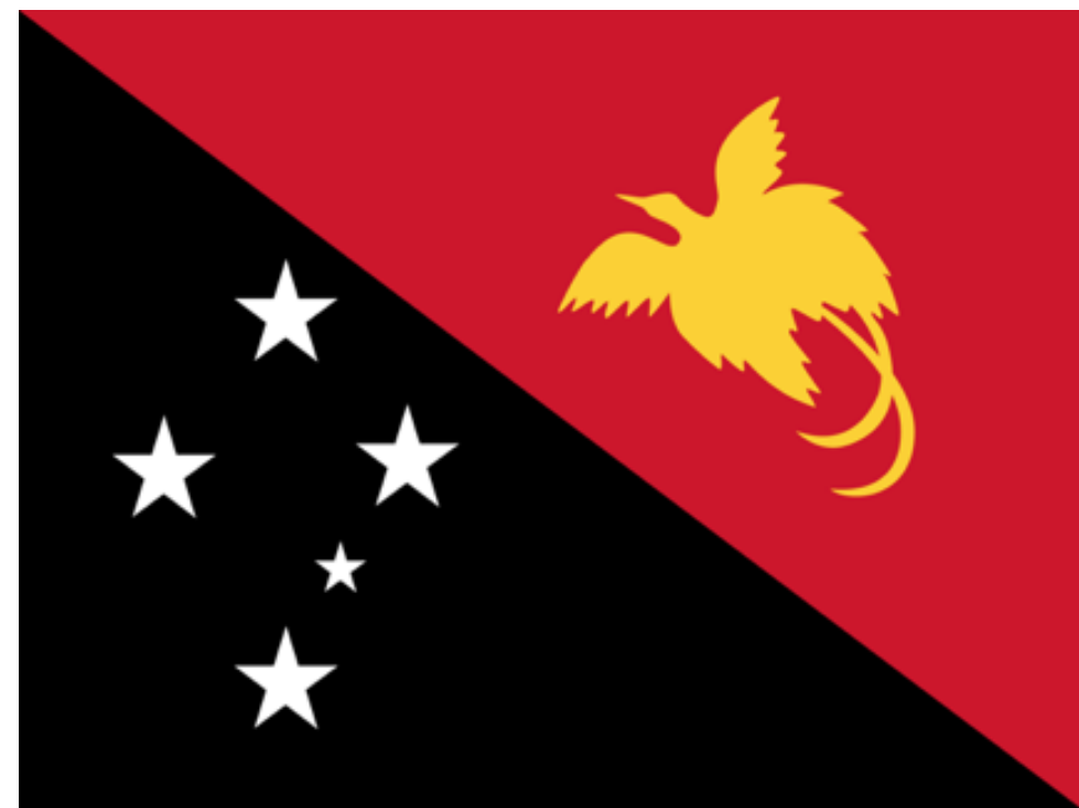
Papua New Guinea (1 point)