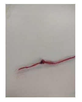
Step 2 - Use wool or embroidery thread and tie a knot onto the end to stop it pulling through the material