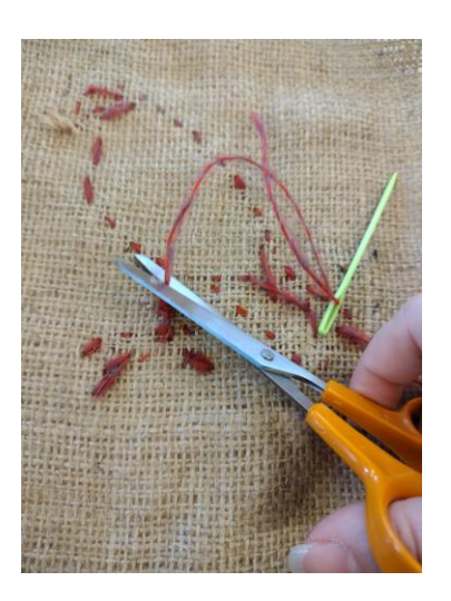
Step 5 - Turn over and tie a knot at the back to secure the thread when finished