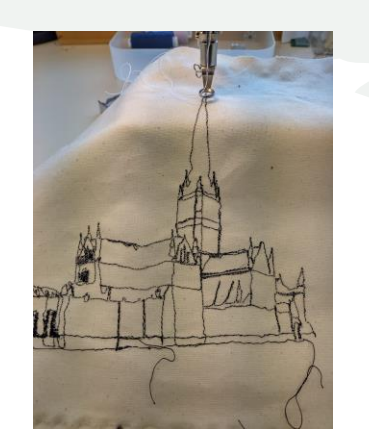
Step 3 - Tear some or all of the paper off the fabric leaving behind only the stitches